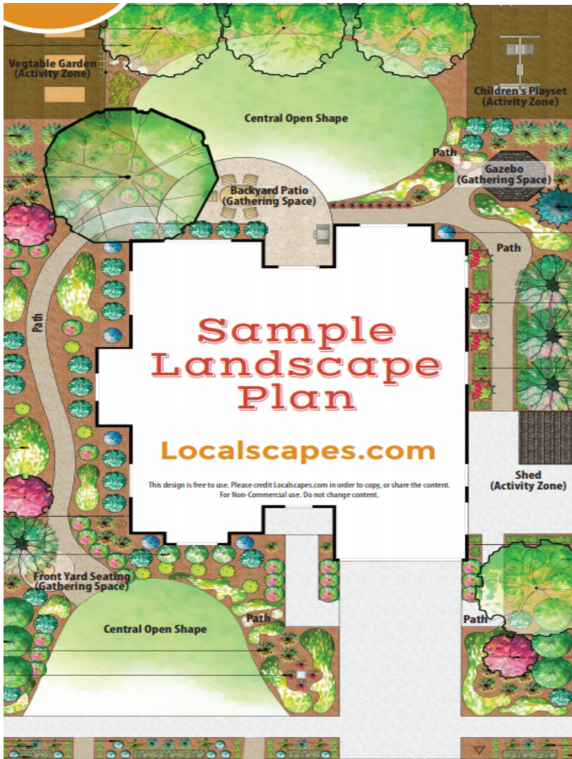
Example: Jordan Valley Water Conservancy District Localscapes